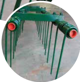
TOP: Mount Arm Tine Clamp BOTTOM: Available in Straight Tines only